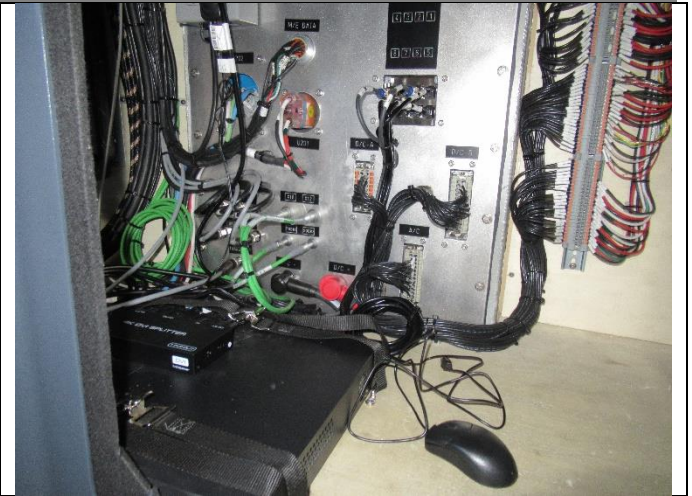
WEATHER MAIN DECK