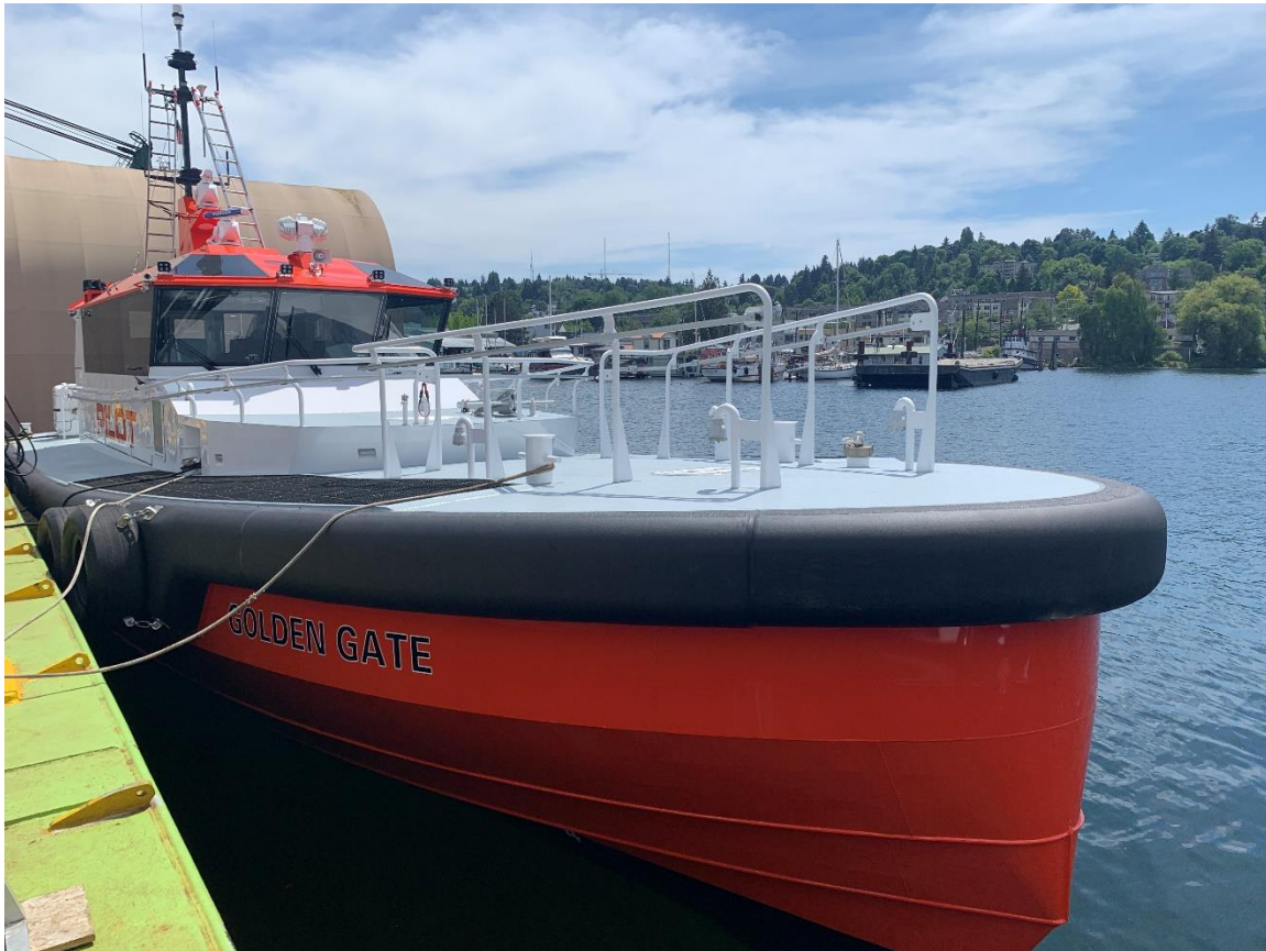
7 June 2023, GOLDEN GATE moored at builder Snow Boat, Seattle, Washington