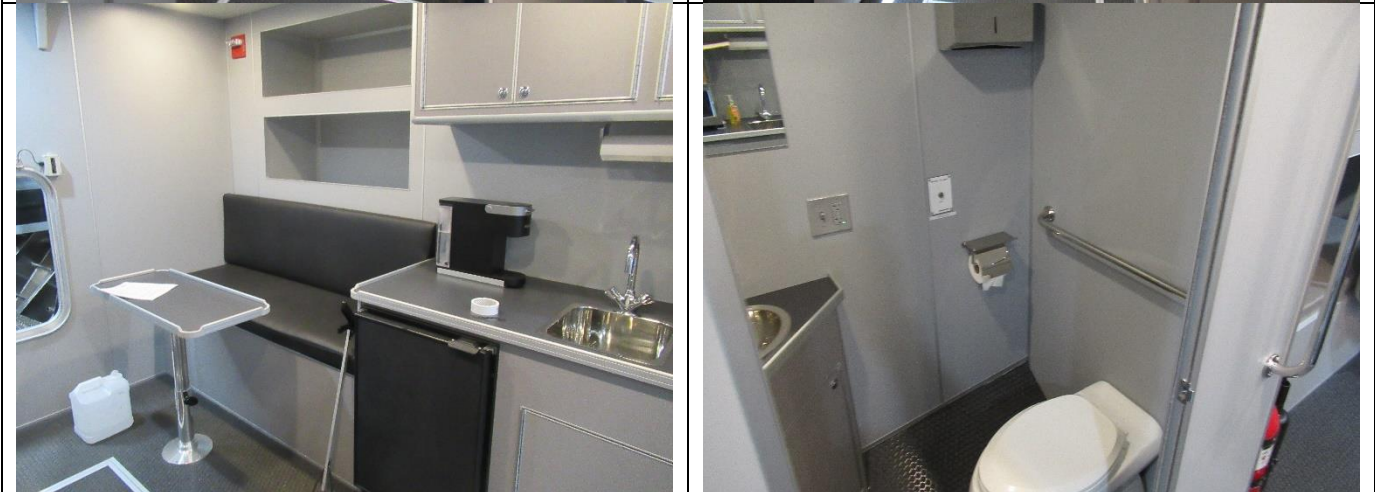
LOWER DECK, MECHANICAL & ELECTRICAL